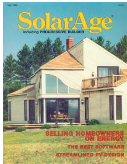
Wells Residence by GroundSwell Architects