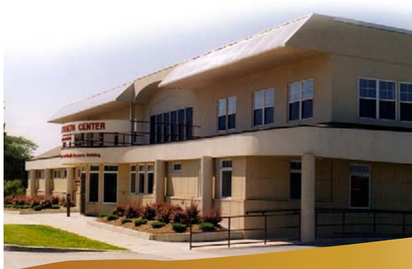
Community Health Center of Burlington, Vermont