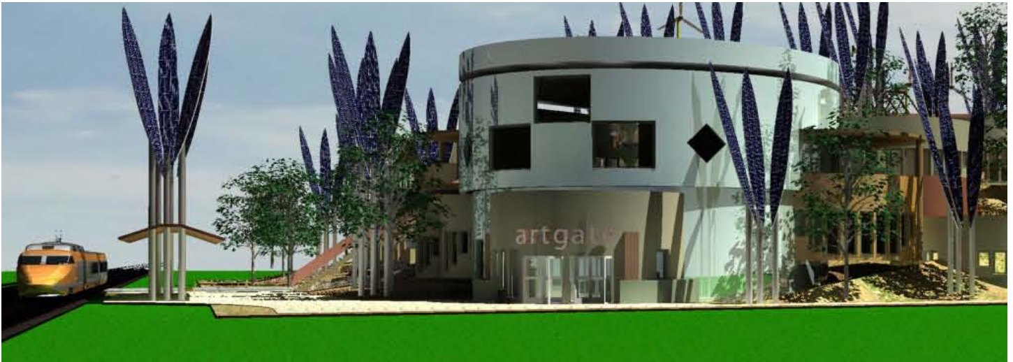
Artgate Competition, Fall 2005

It seemed like a great challenge - a design competition for individual architects to create an artists' center on a strategic site where the City of Burlington was already planning for a six hundred car parking garage. The site is a peculiar blend of natural wooded land to the south and very unsightly parking, railroad tracks and streets on the other sides. It is next to the old Lakeside neighborhood.