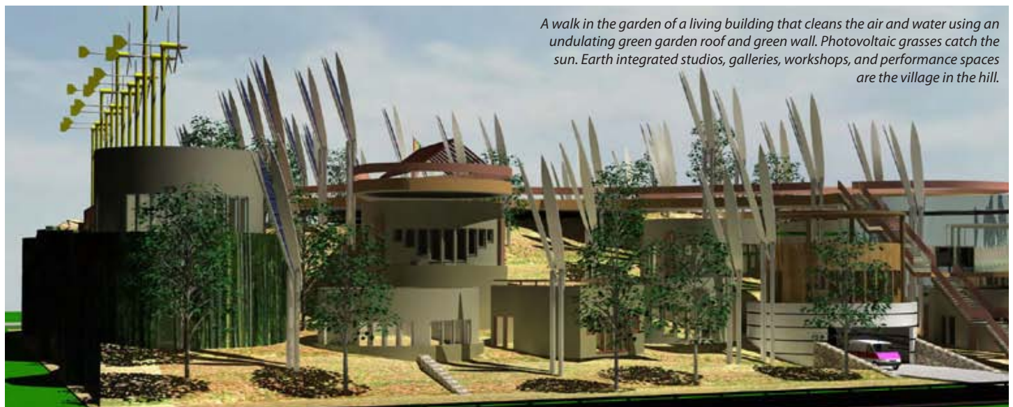
A walk in the garden of a living building that cleans the air and water using an undulating green garden roof and green wall. Photovoltaic grasses catch the sun. Earth integrated studios, galleries, workshops, and performance spaces are the village in the hill.

> ••• Ted Montgomery RA, February 6, 2006